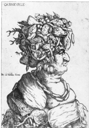
Figure 4 Ambrogio Brambilla Carnival Bibliothèque Nationale de France