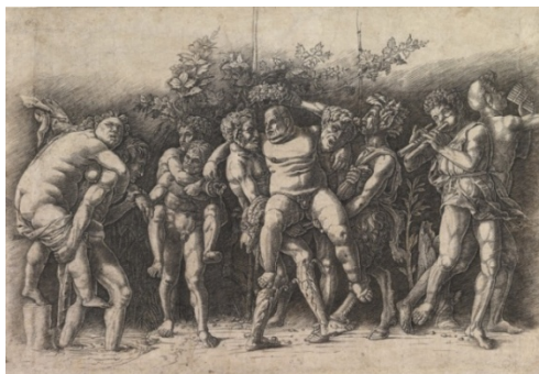
Figure 7 Andrea Mantegna Bacchanal with Silenus , early 1470s The Metropolitan Museum of art, New York