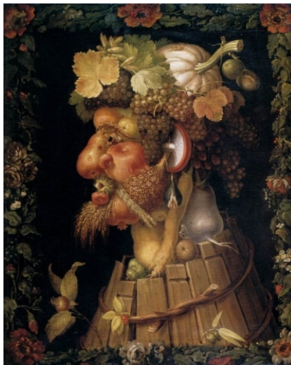
Figure 5 Arcimboldo Autumn , 1573 Oil on canvas, 76 x 64 cm Musée du Louvre, Paris