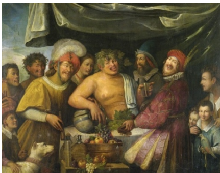
Figure 6 Niccolò Frangipane Bacchanal , second half of the 16th century Unidentified location